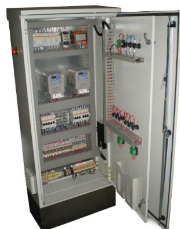
Motor Drive Unit

*The Information included in this data sheet may be changed without advise. rev_01/14