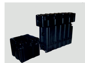
Military or Standard HardCases